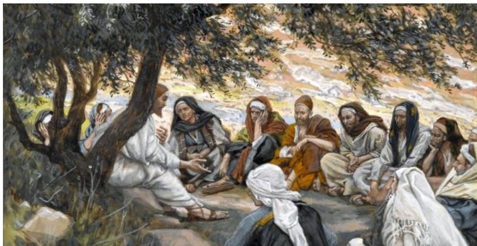
Jesus talking to his twelve disciples by James Tissot

There are instances in the Gospels when Jesus is heard to explain his parables, though most believe that this reflects the interpretation of early Christian communities written into the finalised text.