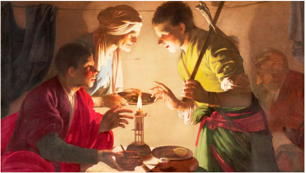
Esau Selling His Birthright by Hendrick ter Brugghen c. 1627

Read the beautifully told story in Chapter 27 of Genesis along with today's lesson and you're led into a skilfully observed family drama featuring intense sibling rivalry, no doubt fostered by parental favouritism whereby Esau was singled out for the attention of his father Isaac, and Jacob was his mother's boy. Esau's rough and ready somewhat boorish nature whereby his stomach ruled his head proved no match for Jacob's devastating ability to use his calculating head to serve his own ends. Perhaps he'd learned from his mother Rebecca who may have been an impressionable doe-eyed beauty when first married but, whether by natural tendency or marital disappointment had turned out to be a first-rate schemer and manipulator for whom her ageing husband, short-sighted in more ways than one was, in a manner of speaking, a complete push-over. While Jacob inveigled his older brother to trade his birth-right for a square meal, Rebecca devised the strategy that made this an actuality, dressing Jacob in his brother's clothes, wrapping his arms and neck with animal skins to make them feel like Esau's, and sending him to his blind father with a savoury supper to receive the coveted blessing. Once the deed was done, no hindsight and regret on Isaac and Esau's part could revoke its effect, and the benefits, material and otherwise belonged forever to Jacob and his descendants.